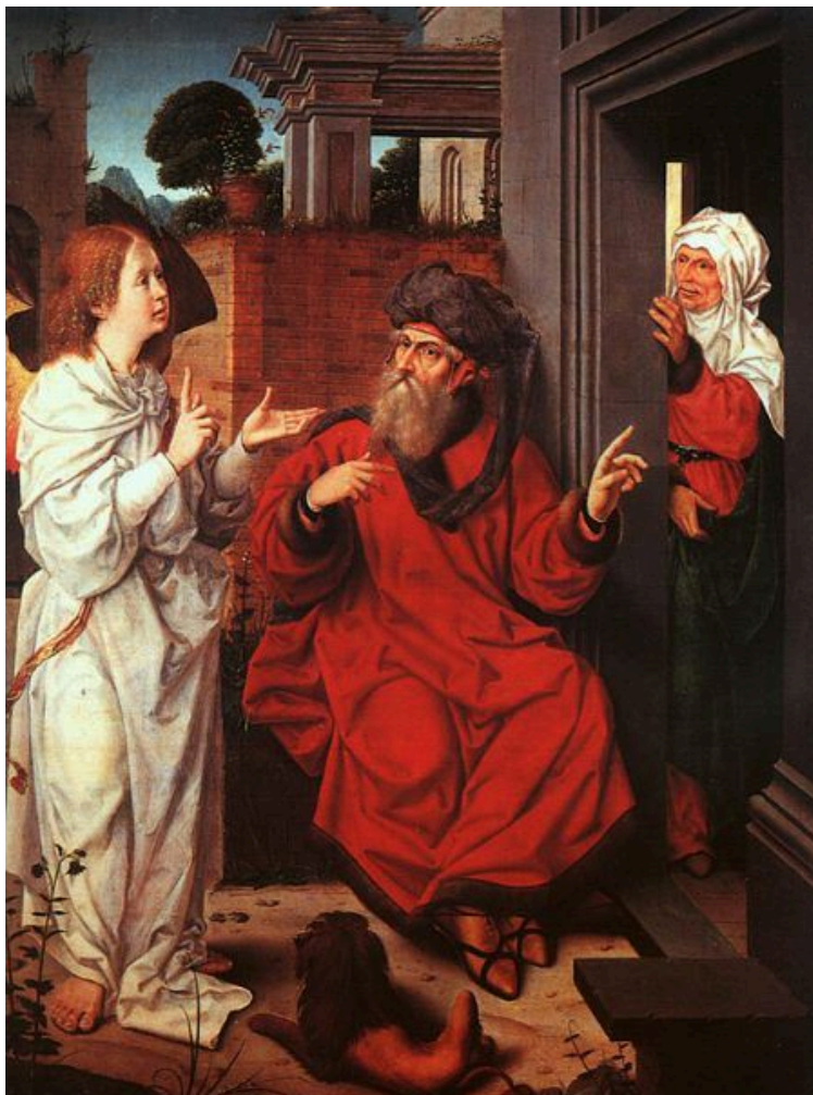
Provoost, Jan. Abraham, Sarah, and the Angel, from Art in the Christian Tradition , a project of the Vanderbilt Divinity Library, Nashville, TN.