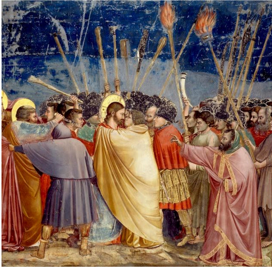
Bondone, Giotto di, 1266?-1337. Kiss of Judas, from Art in the Christian Tradition , a project of the Vanderbilt Divinity Library, Nashville, TN.