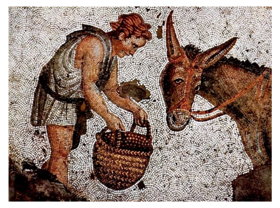
Child and Donkey, from <u>Art in the Christian Tradition</u>, a project of the Vanderbilt Divinity Library, Nashville, TN.