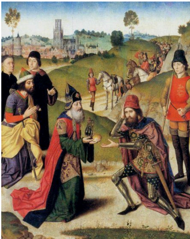
Bouts, Dieric, 1415-1475. Meeting of Abraham and Melchizedek, from Art in the Christian Tradition , a project of the Vanderbilt Divinity Library, Nashville, TN.