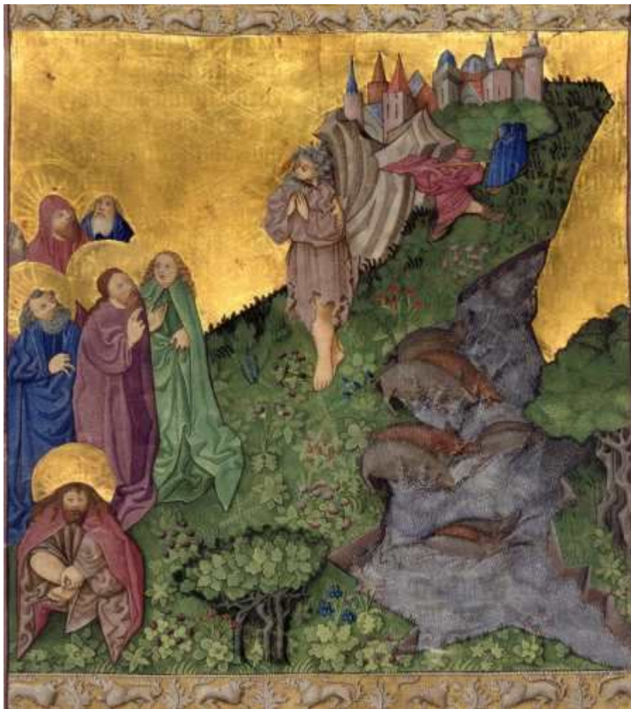
Anonymous. Jesus, the Gerasene, and the Unclean Spirits, from Art in the Christian Tradition , a project of the Vanderbilt Divinity Library, Nashville, TN.