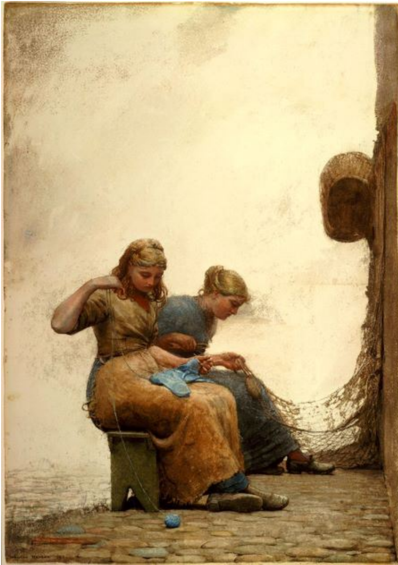
Winslow Homer, 1836-1910. Mending the Nets, from Art in the Christian Tradition , a project of the Vanderbilt Divinity Library, Nashville,